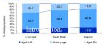
Figure: % change in total population from 2001-2018 Source: Mid-Year Estimates (ONS)