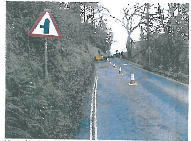
View along the A387 Sandplace Road

For your own safety we trust you will work with us on the project, and take particular note of the diversionary routes and any revised road and footway layouts and follow the signs as directed.