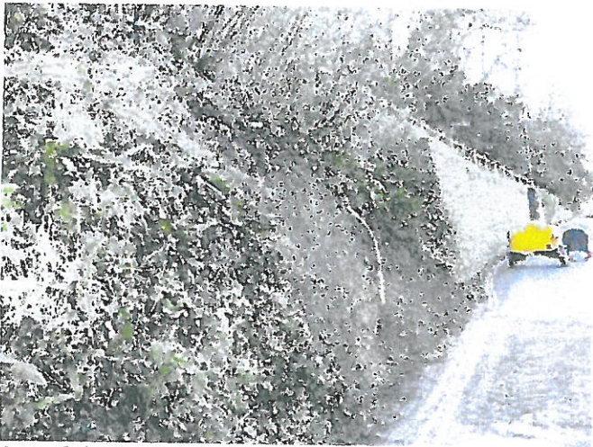
Area of slope stabilisation works

This will be done by installing a conventional 'soil nailing, meshing and bolting' support system.